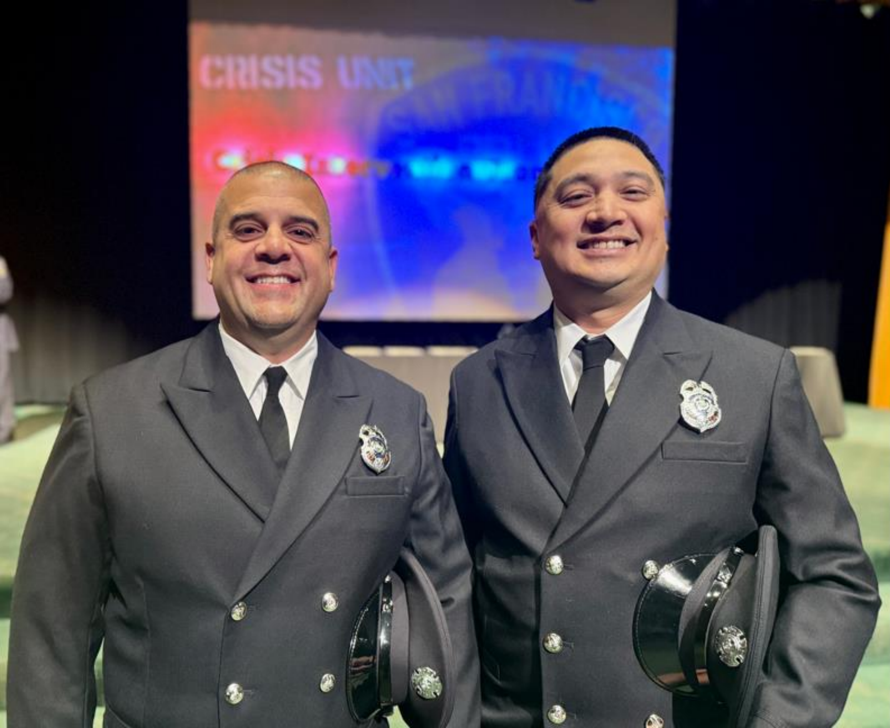
SFPD Crisis Intervention Team Awards Ceremony May 27