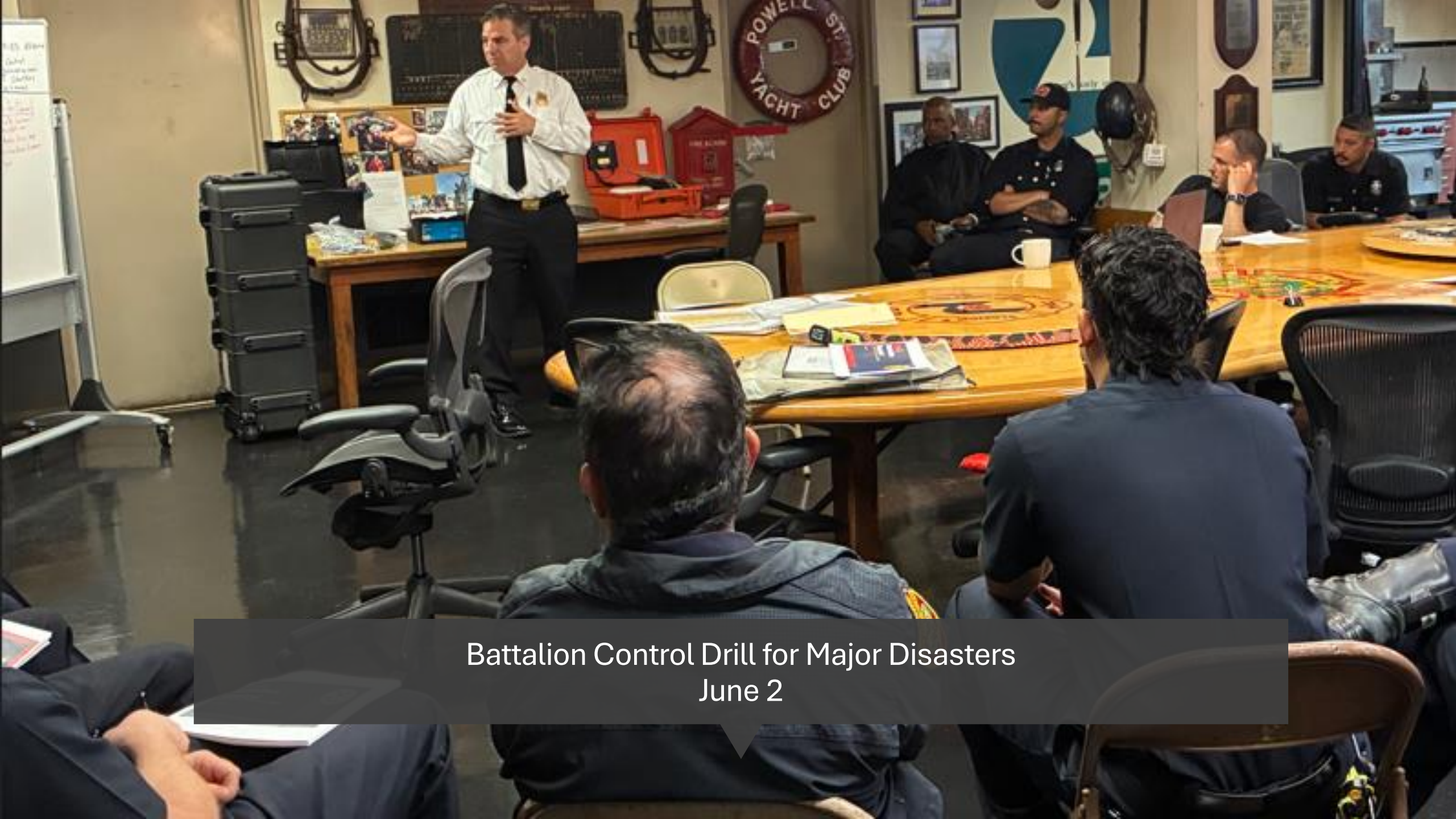
Battalion Control Drill for Major Disasters June 2