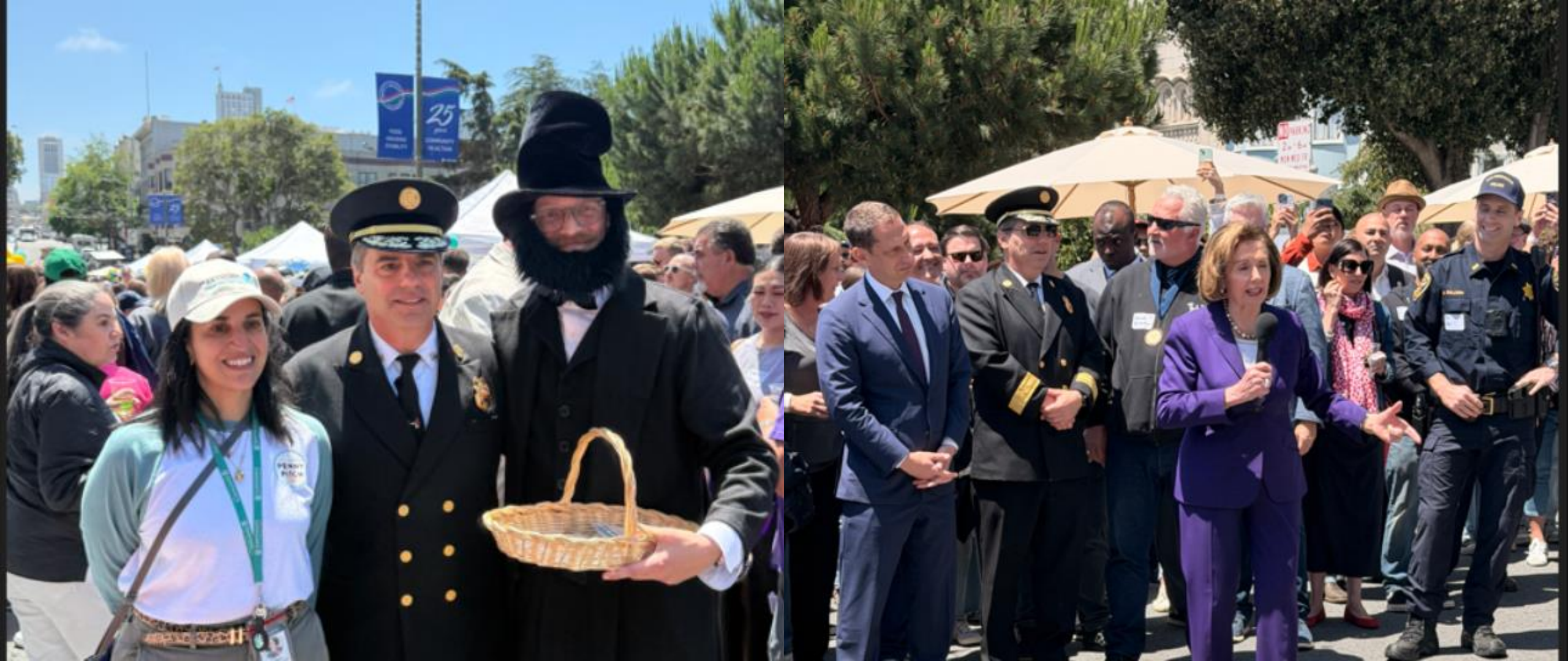
St. Anthony's Annual Penny Pitch Event May 8